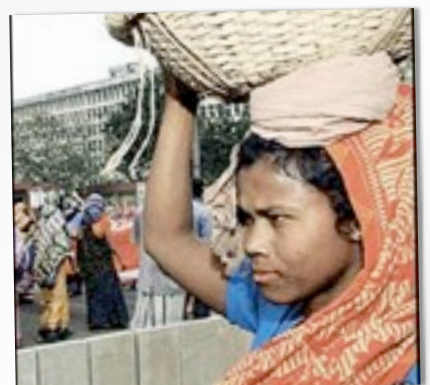
WOMEN IN BANGLADESH